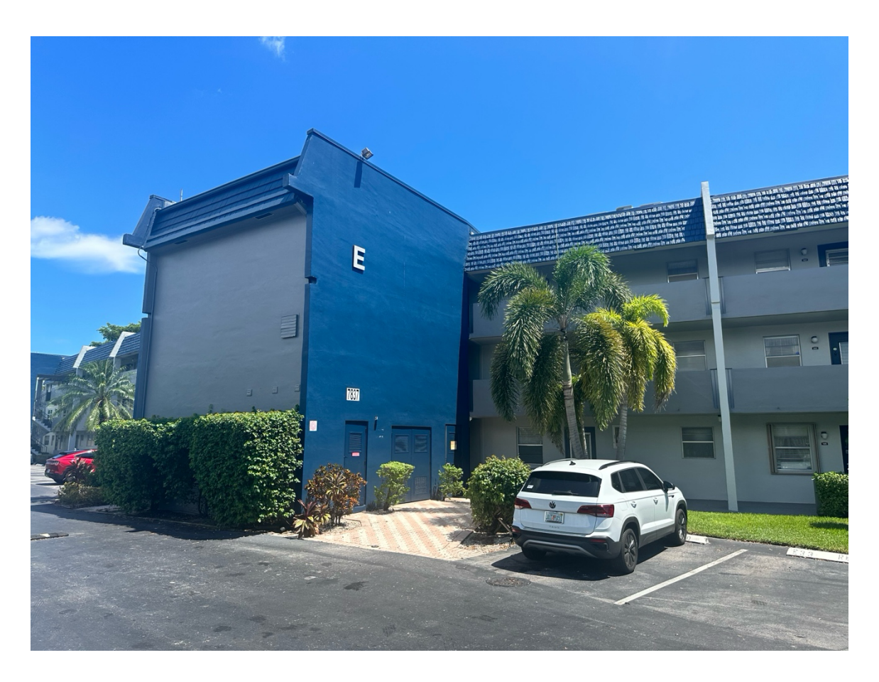
Oriole Golf & Tennis Club Condominium One Bldg. E (7837)

7837 Golf Circle Drive, Margate, FL 33063